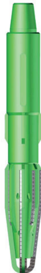
Long taper mill with straight blades and TOPMILL inserts

They can be hardaced with your choice of TOPLOY or TOPMILL / SWORDFISH inserts.